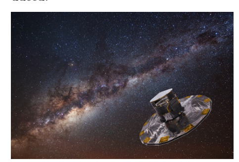
The ESA Gaia mission mapping the Milky Way

by Pedro Alonso Palicio The Galactic chemical evolution will be studied, including lectures on stellar nucleosynthesis, chemical yields and chemical evolution models. The origin and chemo-dynamical properties of Galactic populations, as revealed by current surveys, will be also introduced.